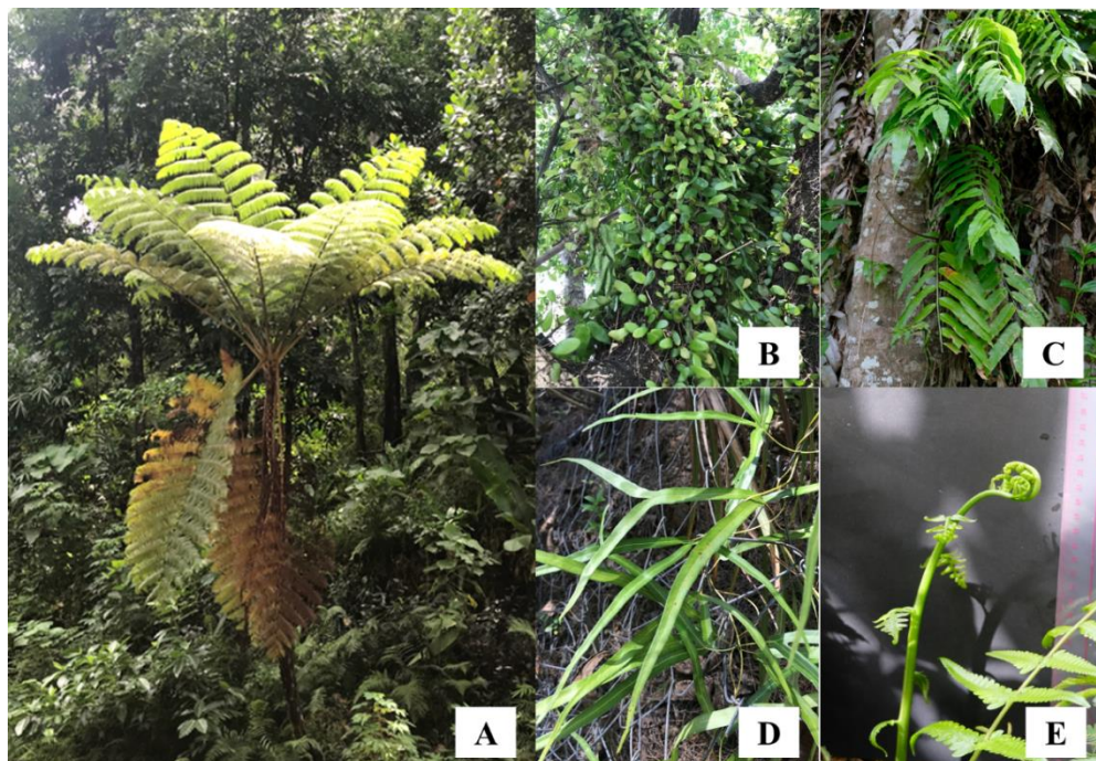
Figure 2. (A) Cyathea contaminans (Wall. ex Hook.) Copel., (B) Pyrrosia piloselloides (L.) M.G. Price, (C) Stenoclaena palustris (Burm.f.) Bedd., (D) Lygodium circinnatum (Burm. f.) Sw., (E) Diplazium esculentum (Retz.) Sw

ferns is also eaten and sold in the market these are D. esculentum (Figure 2E), D. molokaiense , S. milnei , S. palustris , and C. schiedei . Species such as D. linearis , A. evecta , P. tripartita , and Pteris sp. have no known uses in the community. Some pteridophytes also serves double purpose like S. milnei for food and handicraft, S. palustris for food and medicine, and C. contaminans for medicine and ornamental.