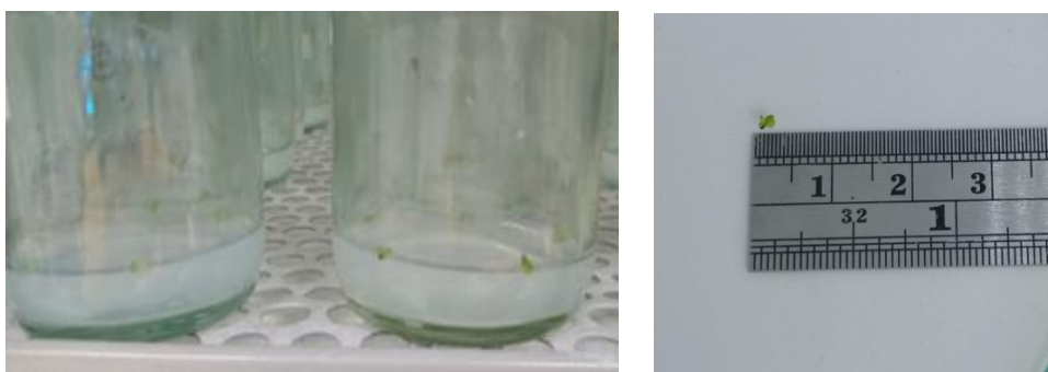
Figure 1. The appearance of protocorm were selected for culture on the medium with difference concentration of NAA and BA

All flasks were transferred to growth room at 25 \pm 2 °C under white florescent light with intensity 2000 lux for the growth and development.