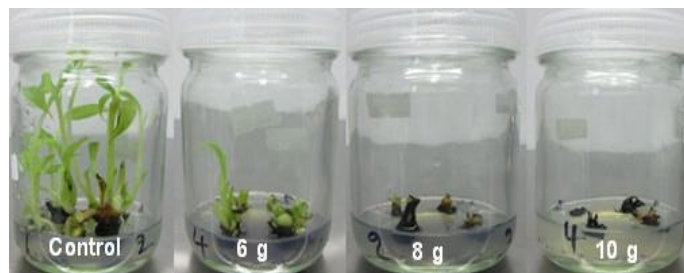
Figure 2. Effect of NaCl concentration on Hom Thong banana survival rate and growth

Screening of mutagenized cultures during dedifferentiation and differentiation stages could be useful for salt tolerance selection. The present study indicated increasing in survival rate of banana exposed to gamma irradiation and cultured on medium supplemented with salt. This increasing may have resulted from changes defensive mechanisms. Gamma irradiation modulated expression in the metabolic and synthesis of osmolytes which have been correlated with their capacity to tolerate and adapt to salinity condition.