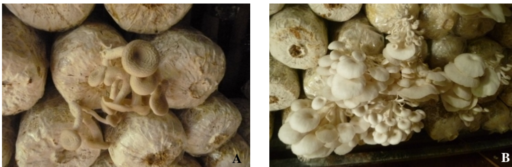
Figure 2. Representative photographs of fruiting bodies of L. squarrosulus (A) and P. ostreatus (B) grown on substrate prepared from cassava waste

In conclusion of this research, L. squarrosulus and P. ostreatus can be successfully cultivated by mixing substrates of cassava bagasse and sawdust. The highest rate of mycelia growth for L. squarrosulus and P. ostreatus was observed in the control while the highest yield of L. squarrosulus (1.515 kg) and P. ostreatus (2.670 kg) were obtained from the substrate mixture containing sawdust: cassava bagasse at ratio of 75:25 (w/w). The result indicates that