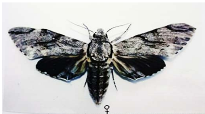
Figure 5. Adult female of Psilogamma increta .