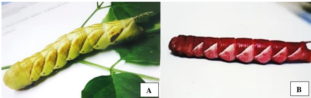
Figure 2. The larval have 2 forms ; A = green form B = brown or reddish brown form