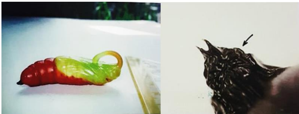
Figure 3. A pale green proboscis sheath at the anterior end and on the posterior end of pupa shown a rough and blackish brown cremaster with 2 cremastral hooks.