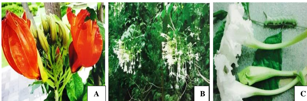
Figure 6. Host plants of Psilogamma increta are African tuliptree (A), cork tree(B) and Dolichandrone serrulata (C)