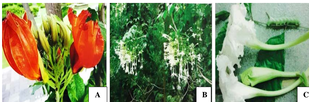
Figure 6. Host plants of Psilogamma increta are African tuliptree (A), cork tree(B) and Dolichandrone serrulata (C)