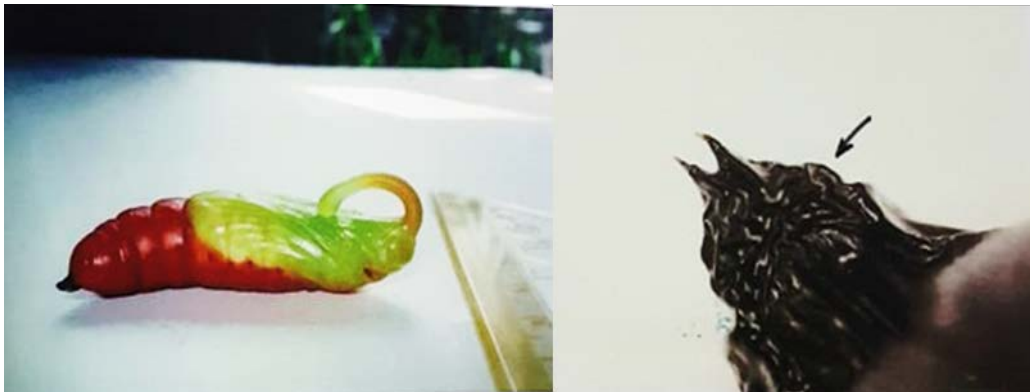
Figure 3. A pale green proboscis sheath at the anterior end and on the posterior end of pupa shown a rough and blackish brown cremaster with 2 cremastral hooks.