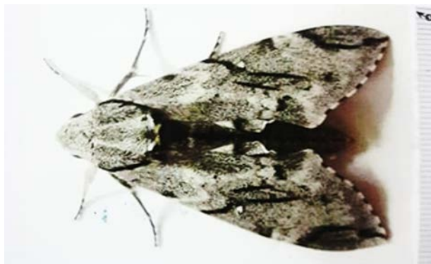
Figure 4. Adult male of Psilogamma increta .