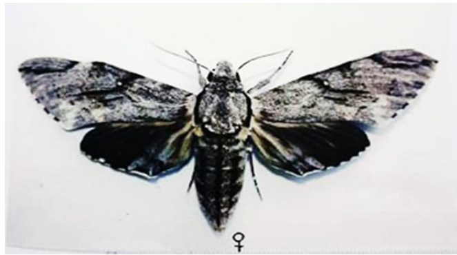
Figure 5. Adult female of Psilogamma increta .