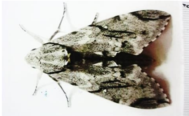
Figure 4. Adult male of Psilogamma increta .