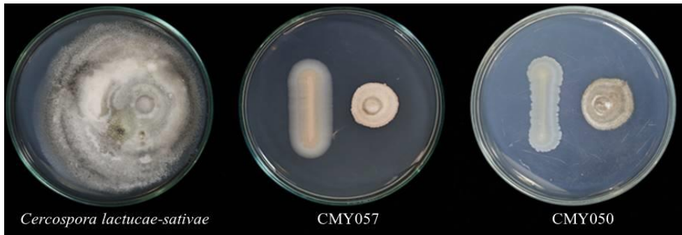
Figure 2. Screening for with inhibitory activity on C. lactucae-sativae mycelial growth on PDA by dual culture technique

isolates tested were able to inhibit the growth of three pathogens each by more than 60% is CMY057, CMY050, CMY017, CMY027 and CMY035. In seventy-five isolates CMY117 gave the lowest percentage inhibition of 14.75% against while CMY057 and CMY050 gave the highest inhibition of 76.50-77.18%.(Fig. 2)