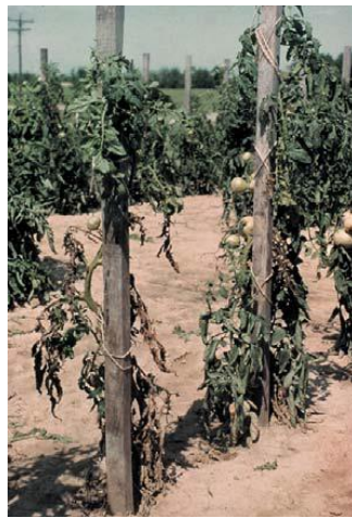
Fig. 1. Fusarium wilt