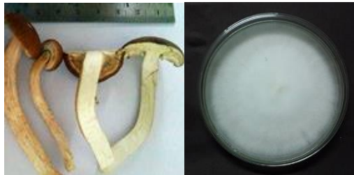
Fig. 4. Lactarius sp