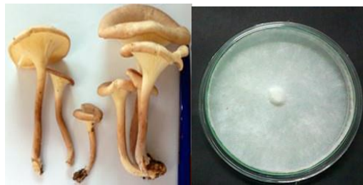
Fig. 3. Clitocybe spp

Two specimens were collected from Thailand. They are Clitocybe spp AJ2-2, Boletus affinis var. maculosus AJ2-3, described as follows: Clitocybe spp AJ2-2 : Cap 0.5-7 cm across, purperish to pink to pale brown, horn with strongly depress in the center and inrolled margin becoming wavy. Gills are decurrent, white to olive-yellow. Stem 3.5-9 cm, cylindrical, smooth, and pink to dark brown. Habitat grows in clusters (Fig. 3). Boletus affinis var. maculosus AJ2-3 : Cap 1-3.5 cm across, velvety redish-brown, dry shin, having a membraneous vein on the top part which promptly turns to tobacco color due to the falling spores. Gills are adnate, white. Stem is 6-9 cm long, cylindrical, silky membranous, smooth. Habitat grows in clusters (Fig.4).