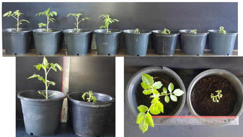
Fig. 7. Pathogenicity test

Where: C-Control (root soaked into sterilized water) T-Test (root soaked into spore suspension 10^6 )