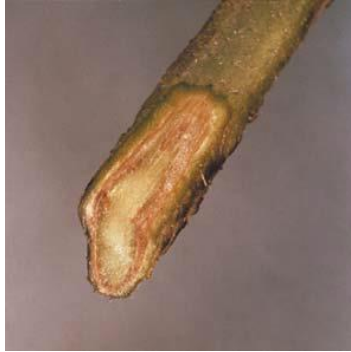
Fig. 2. Vascular browning caused by Fusarium wilt