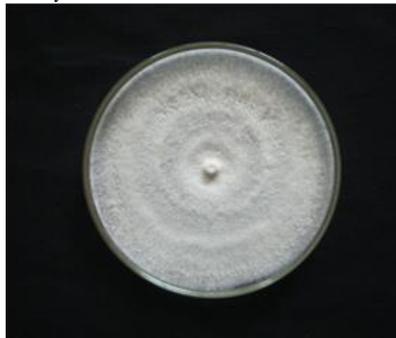
Fig. 3. Pure culture of Ganoderma on potato dextrose agar at 7 days