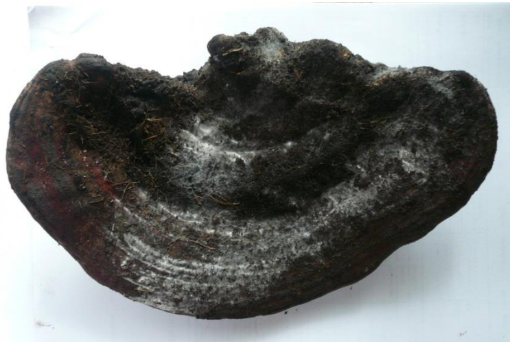
Fig. 1. Fruit body of Ganoderma boninense infected to Oil Palm Trees in Malaysia

The fruit bodies of Ganoderma were identified as Ganoderma boninense . Pure cultures were isolated from samples from Thailand and from Malaysia.