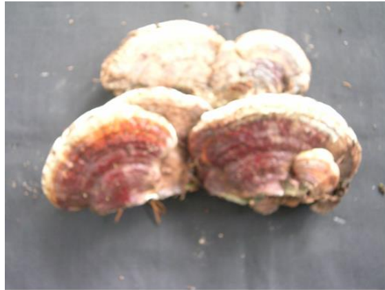
Fig. 2. Fruit body of Ganoderma infected to Oil Palm Trees in Thailand