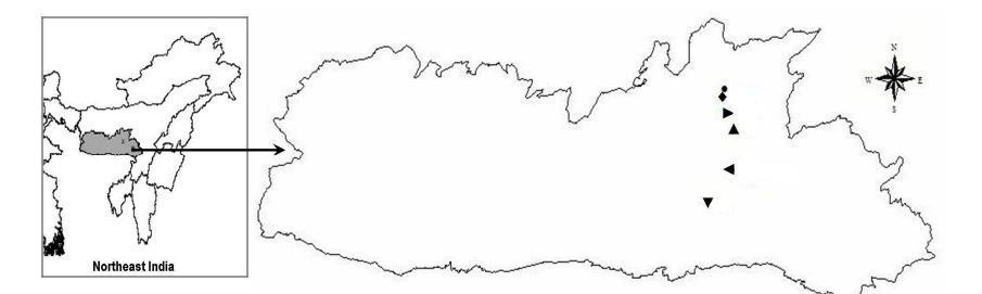
Fig. 1. Map of northeast India showing study sites in Meghalaya Whereas; ● -Umdihar; Umsaw; ▶ -Mawlein; ▲ -ICAR; ◀ -Upper Shillong; ▼-Swer.

The isolated spores were picked up with needle under a dissecting microscope and were mounted in polyvinyl alcohol–lactoglycerol (Koske and Tessier, 1983) and also in mixed polyvinyl alcohol–lactoglycerol and Meltzer's reagent (1:1, v:v) for identification. The complete and broken spores were examined using a Olympus compound microscope. All the spores were photographed with the help of Leica EC 3 camera attached in Leica dm 1000 microscope. Taxonomic identification of spores to species level was based on sporocarpic size, colour, ornamentation and wall characteristics by matching original descriptions (Koske, Gemma et al. , 1986; Almeida and Schenck, 1990; Wu et al. , 1995; Oehl and Sieverding 2004). All the permanent slides were deposited in the Microbial Ecology Laboratory, Botany Department, North Eastern Hill University, Shillong.